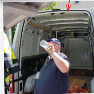
With the intense heat it wasn't long before we were all reaching for the water.