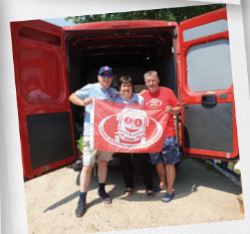
When we had finished unloading and cooled off, it was time for a bit of fun.