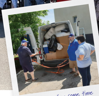
After spending some time with the children we started the unloading process