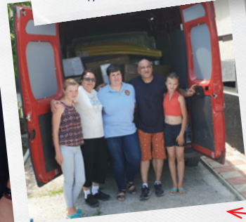
Some of the children joined us to help with the unloading