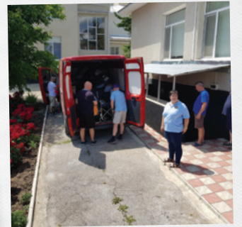
This turned out to be quite a task as the temperature was in the mid 30's.